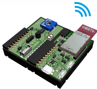
Sensor kit temperature, light intensity and voltage

UP board 2GB memory + 32GB eMMC Intel x86 x5-z8350 SoC Compatible with Windows 10 full version, Linux, Android